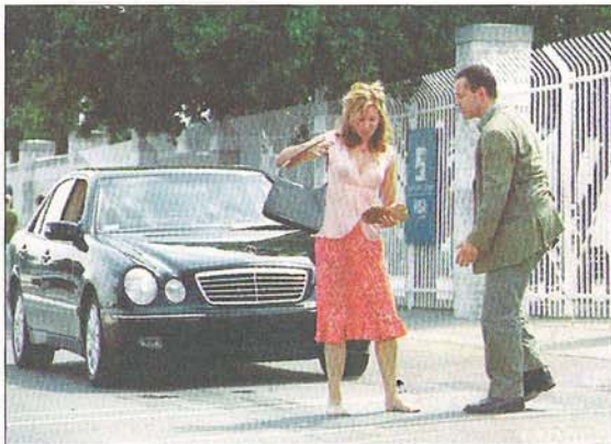
"Keep Your Distance" stars Jennifer Westfeldt and Gil Bellows.